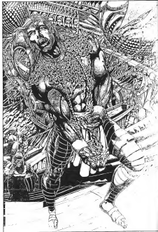
ILLUSTRATION BY BOB COOPER